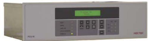
Printer Control Unit PCU III (Please note: ACC not included)