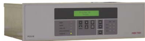
Printer Control Unit PCU III (Please note: ACC not included)