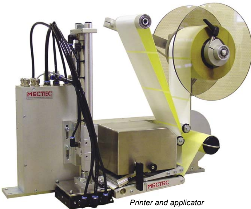
Printer and applicator in right hand version