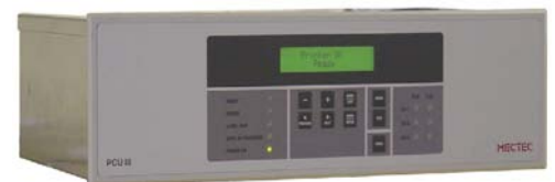
Printer Control Unit PCU III