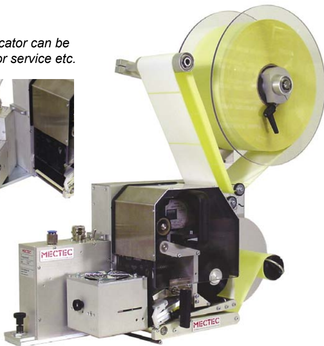
Printer and applicator in right hand version