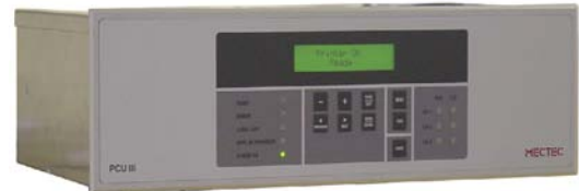
Printer Control Unit PCU III