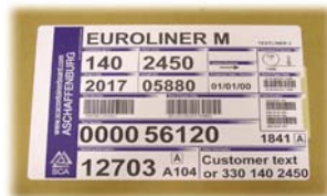
TW300 is ideal for A3 labelling within the Paper industry.