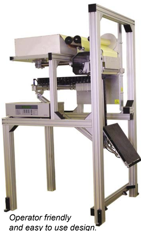
Operator friendly and easy to use design.