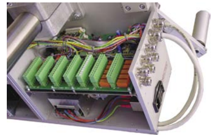
Controller and I/O:s easy accessible